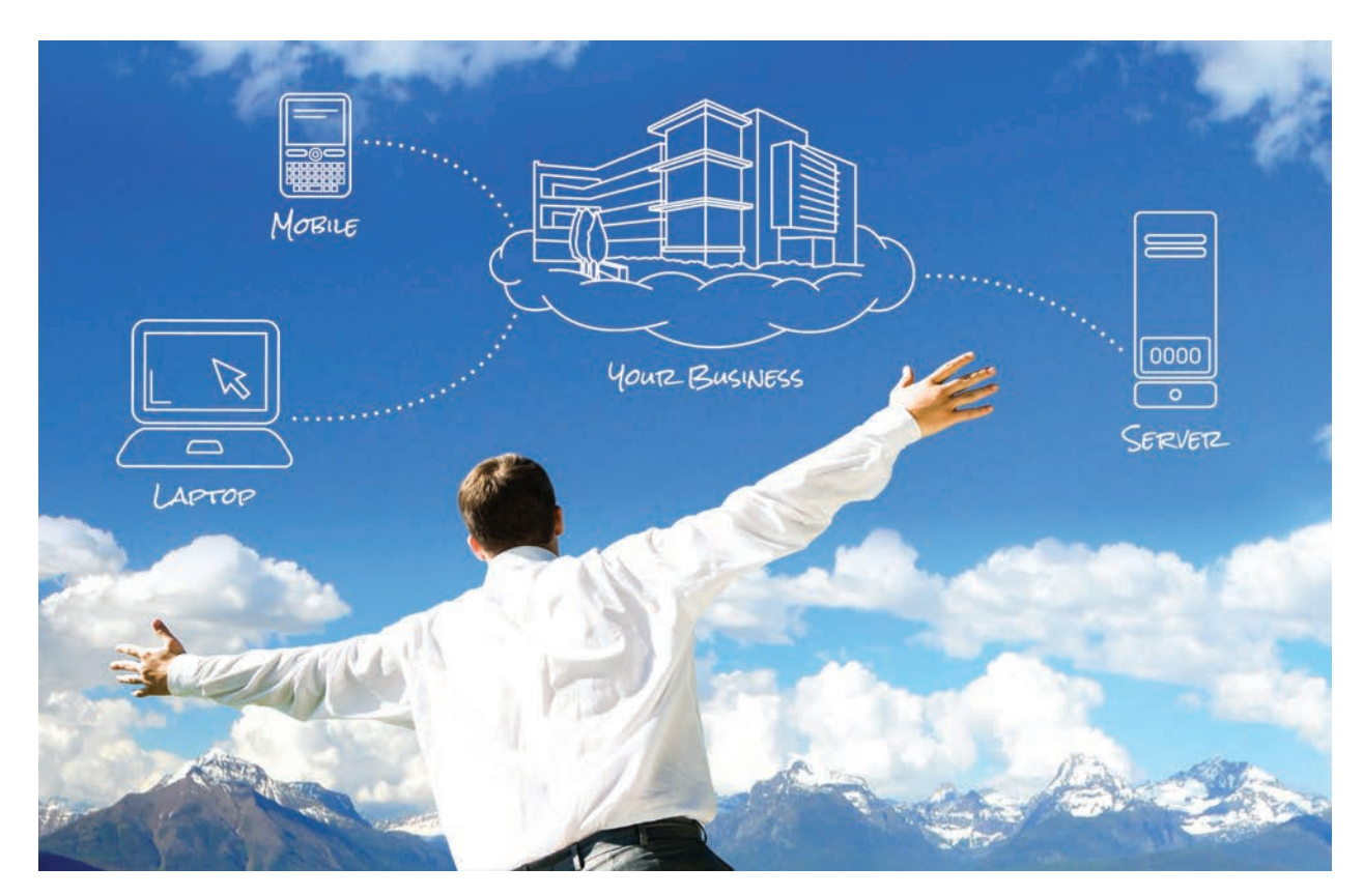
PDM ENTERPRISE-CLASS CLOUD SERVICES